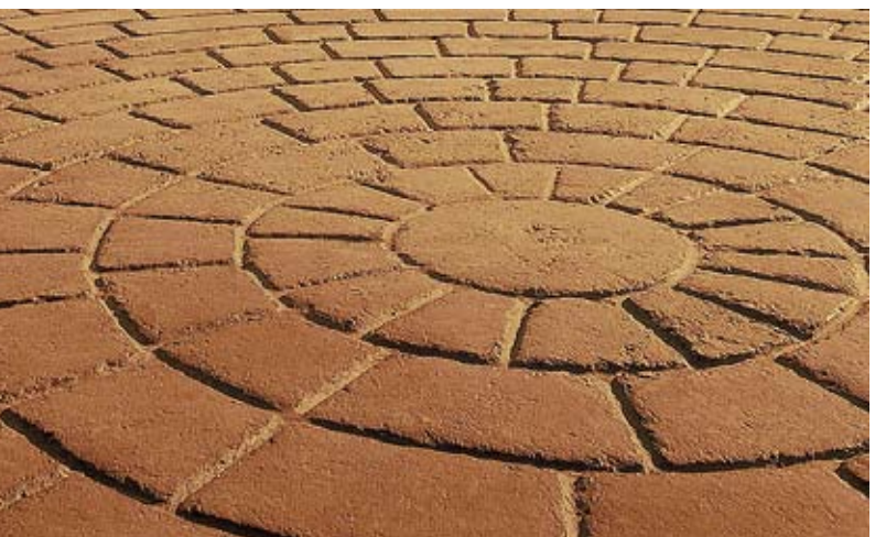
The IPC family of decorative asphalt products.

Founded in 1992, Integrated Paving Concepts Inc. is a public company. IPC has a broad distribution network of applicators in over 40 countries around the world.